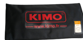
Bag for hood